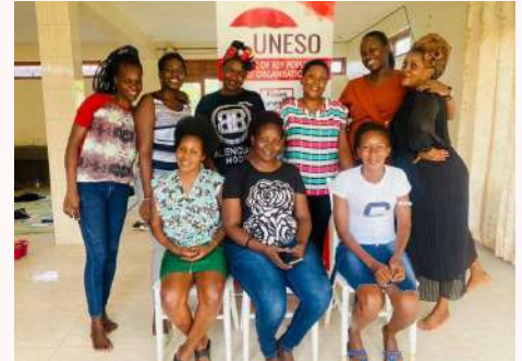
LBQ Sex Workers and UNESO staff at the Northern Region Healing in Solidarity Training of Trainers

After the workshop, UNESO embarked on a regional training exercise on Healing in Solidarity Training of Trainers.