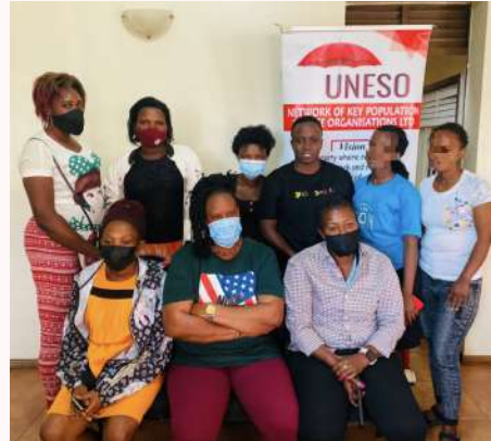
LBQ Sex Workers and UNESO staff at the Western Region Healing in Solidarity Training of Trainers