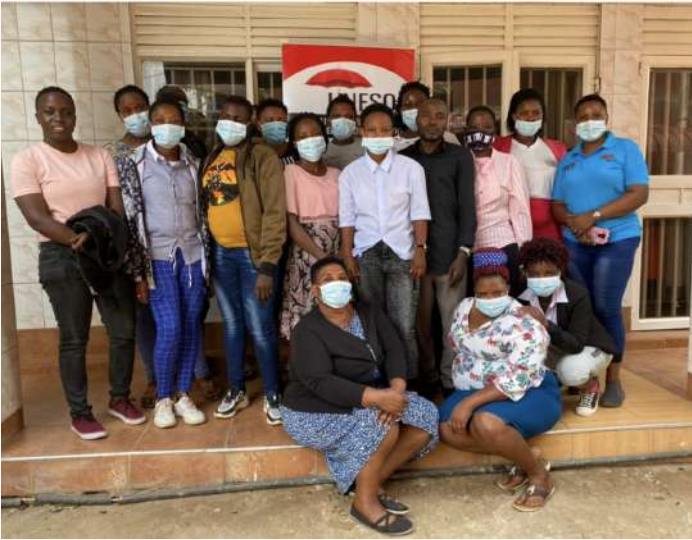
Sex Worker leaders and UNESCO staff at the Western Region of the Coalition Building Training