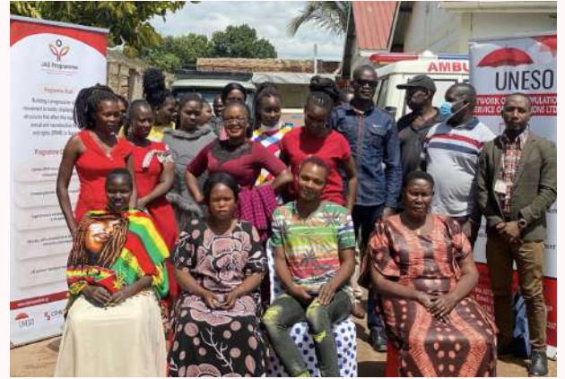
Participants in Gulu

As a strategy to promote the Sexual Reproductive Health and Rights (SRHR) of sex workers, UNESO routinely holds community and stakeholders engagements. On the 27th of April 2022, UNESO, under the JAS program, held a dialogue with community stakeholders and sex workers in the districts of Gulu and Busia. The stakeholders included local chairpersons, women leaders in the respective communities, lodge and bar managers, and health workers. The main purpose of the meeting was to create a platform for district stakeholders, partners, and sex workers to discuss and strategize on how to promote SRHR and service delivery among sex workers in the districts.