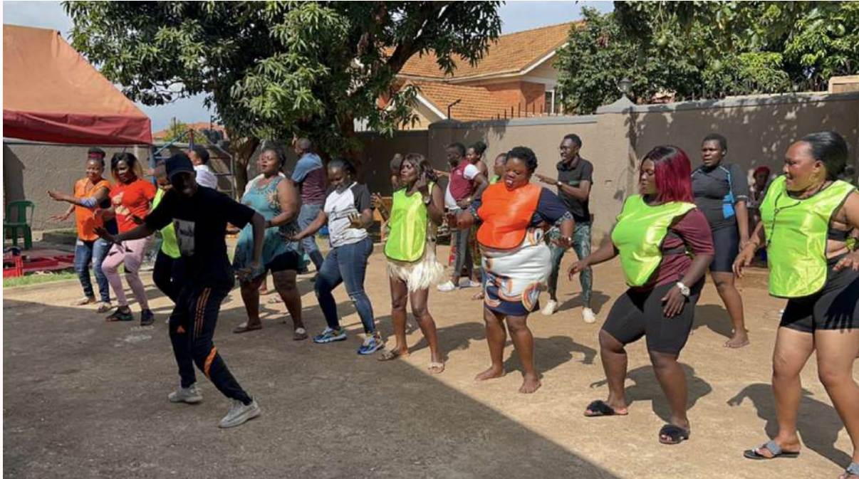
Zumba session during the EDs Forum

One of UNESO's thematic areas is to advance the wellness and well-being of sex worker leaders. In line with this, UNESO conducts a quarterly EDs Forum for its members. During this time, EDs meet, share, network, and participate in different games that enhance their overall wellness and well-being.