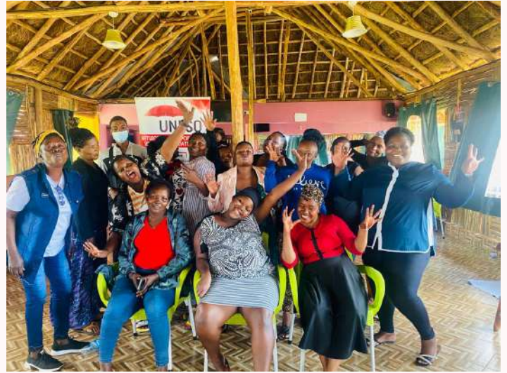
Sex Worker leaders and UNESCO staff at the Eastern Region of the Coalition Building Training

From 11th to 12th February, UNESCO, with support from UHAI-EASHRI, convened a coalition-building training for sex work leaders in the Western and the Eastern regions of the country. This program was able to reach 30 sex worker leaders and was facilitated by our member organizations' leaders in those regions. The leaders were empowered in previous training and therefore knew how to conduct the training. The training offered a space for interaction and networking among the sex worker leaders as well as achieving all the objectives as outlined below: