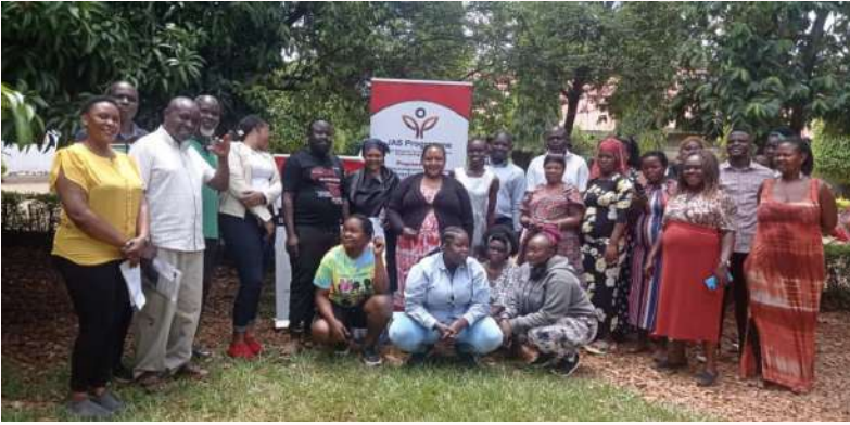
Participants in Busia