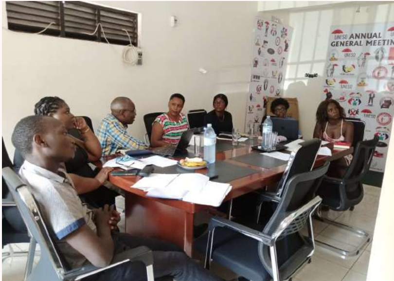
The technical working group meeting at the UNESO offices to discuss the Baseline Study on sex workers who use and inject drugs

With financial support from UHAI, UNESO is currently conducting a baseline study on sex workers who use drugs. UNESO recognizes the diversity of sex workers and is aware of the intersectionality of vulnerabilities that affect the human rights and social justice of sex workers, notwithstanding the sex workers who use and inject drugs.