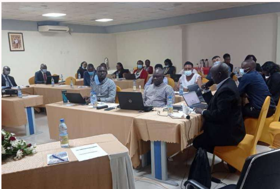
JAS Media Fellows being trained on SRHR, Sex Work, and the Media

Partner engagement meetings provide opportunities to share information, develop relationships among partners, plan future actions, and get work done. While we had numerous partner engagements in this quarter, including taking part in the UGANET women's day campaign, there is one engagement that we would love to highlight because of UNESO's active involvement in the engagement.