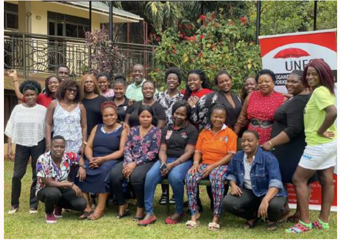
Executive Directors of sex worker-led organizations and UNESCO staff at the Digital and Physical Security Training that happened in Jinja from the 20th to the 25th of March

Sex workers and sex worker-led organizations/groups face a lot of insecurities in form of digital and physical insecurities from both the state actors, non-state actors that put their lives and work at a greater risk. Many of these insecurities and violations go unreported and even if they are reported, they never get justice.