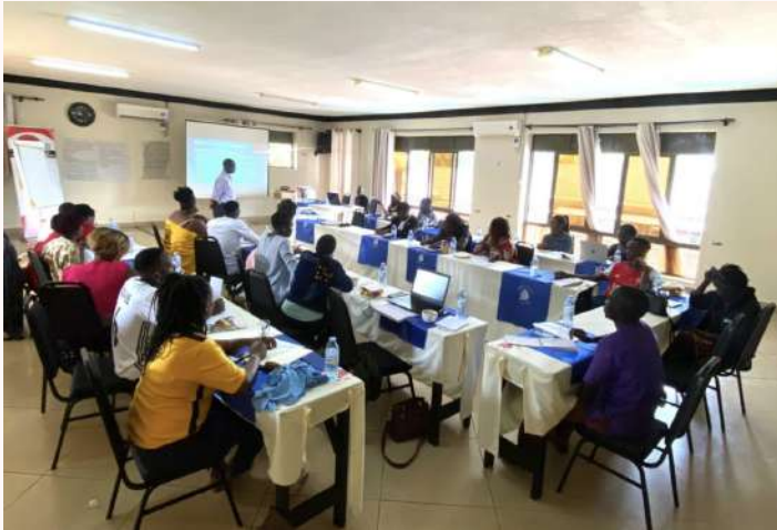
Participants during the finance training for non-finance officers.