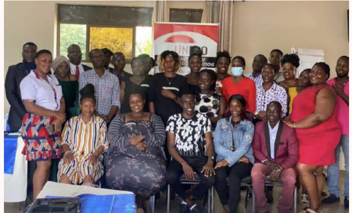
Non-finance officers and UNESO staff at the residential training

On 23rd April 2022, UNESO completed its five-day "FINANCE TRAINING FOR NON-FINANCE OFFICERS" among 25 participants including UNESO staff and Non-finance officers from the Network member organizations. It was an amazing week of being introduced to the world of financial management and accounting.