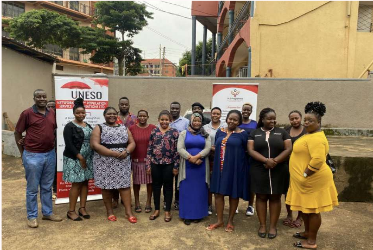
Members of the Sex Work Technical Working Group

UNESO convened the Sex Work Technical Working Group meeting under the Joint Advocacy for Sexual Reproductive Health and Rights (JAS Programme). The Technical Working Group(TWG) has representatives from the Ministry of Health(MARPI), HIV and Quality Health Parliamentary Forum Uganda, and different CSOs like UGANET, Men of the night Uganda, HRAPF, Lady Mermaid Empowerment Centre, WONETHA, OGERA, JEEWAG, Women Positive Empowerment Initiative, Scarlet Initiative Uganda, and Hope Focus Uganda. The meeting discussed SRHR priority issues affecting sex workers in the districts of Gulu and Busia that have been realized in the implementation of the JAS Programme.