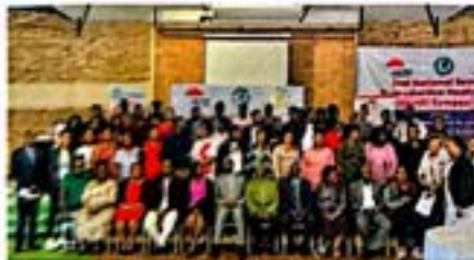
Group Photo for the participants during the 2nd national sex worker's SRHR symposium

The Network convened two SRHR TWG meetings aimed at reviewing the set SRHR priorities for the year, making reflections, and coming up with a way forward on the implementation of the SRHR priorities.