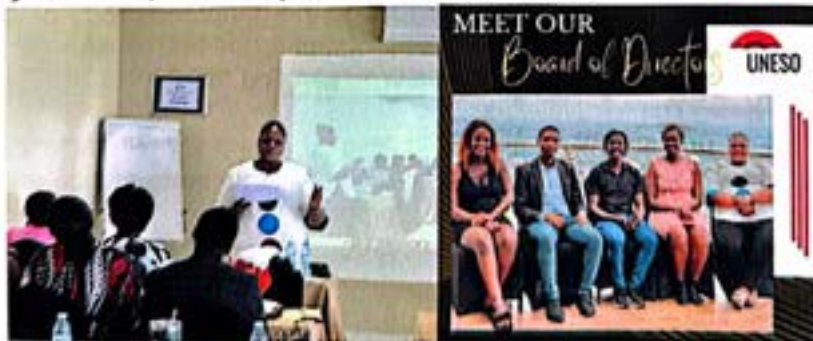
During 4 th AGM 2023