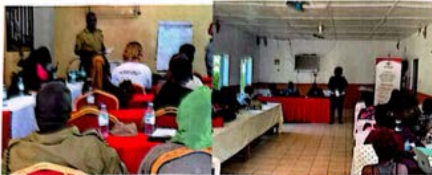
Dialogue in Busia