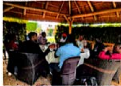
Board and staff retreat session.

relationship between the Board and staff.