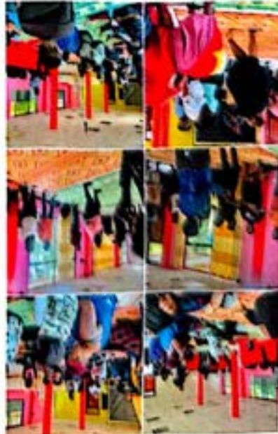
Strategic Theme 6: Emergency response mechanism.

leaders to care for their mental wellness, re-energize, and support collective healing.