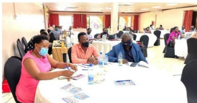
Uganda AIDS Commission and Ministry of Health satellite session for country leaders in HIV Prevention programming, Research and policy as part of the Annual Joint AIDS Review process for the year 2021