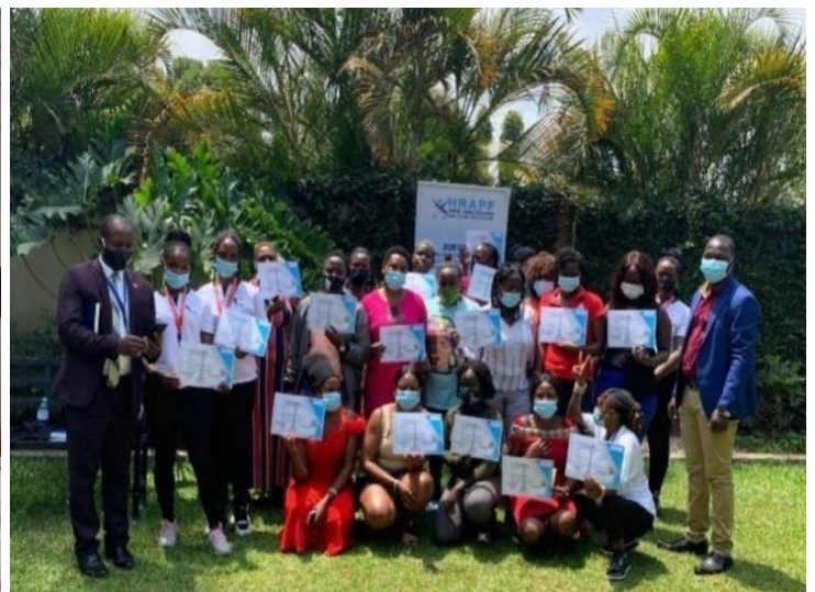
3 UNESO staff took part in the advocacy training of champions organised by HRAPF