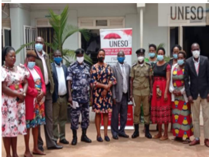
Stakeholders meeting on COVID 19 Kabale