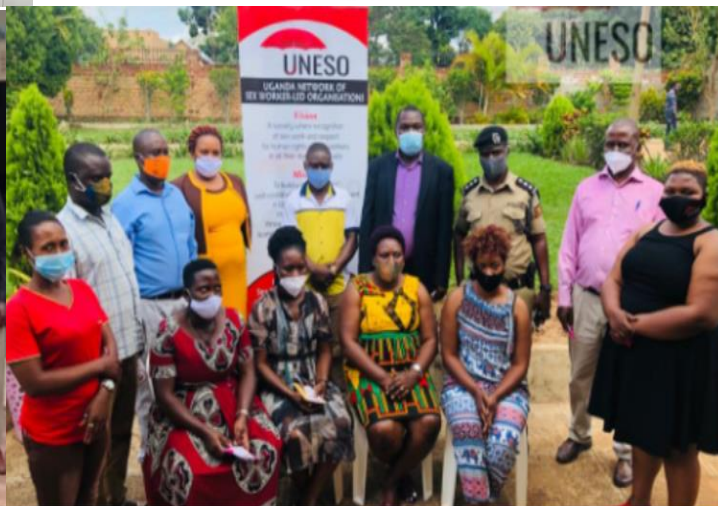
Stakeholders meeting on COVID 19 Mubende