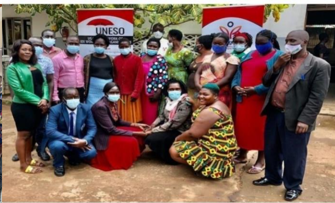
SRHR Training of Health workers in Gulu