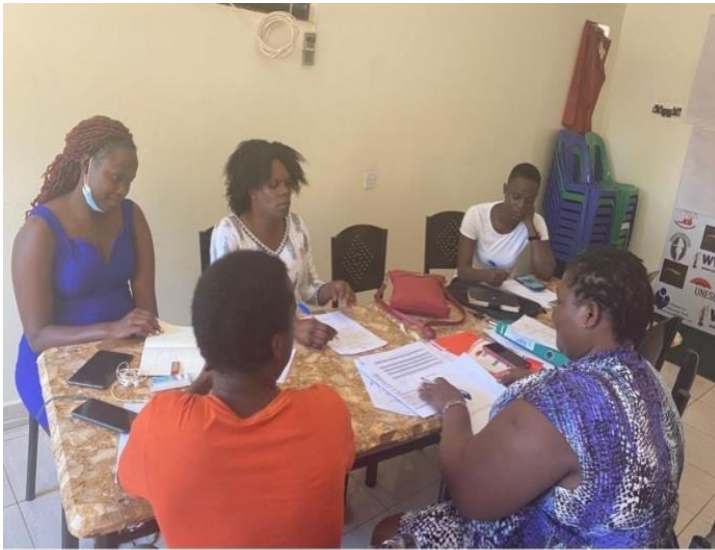
Board of directors meeting at UNESO offices

Have written and submitted 12 proposals to different donors out of which 6 have been won.