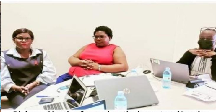
Dialogue Meeting focused on the impact and/ or the implications of the Sexual Offences Act 2021 between key populations and Members of Parliament.