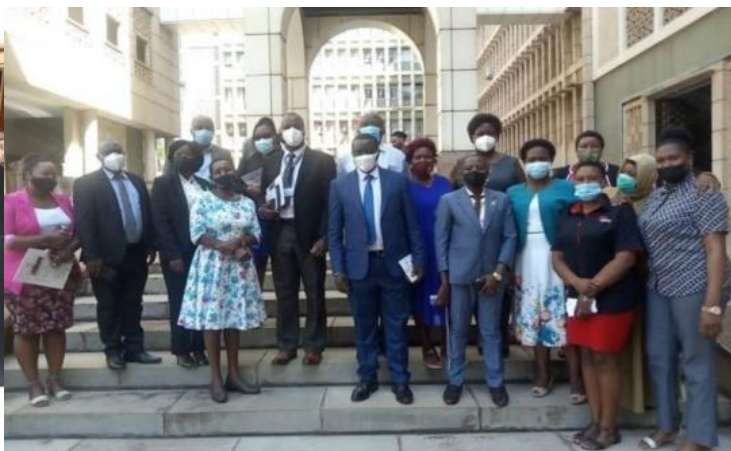
Meeting with Members of Parliament