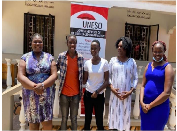
Board of directors