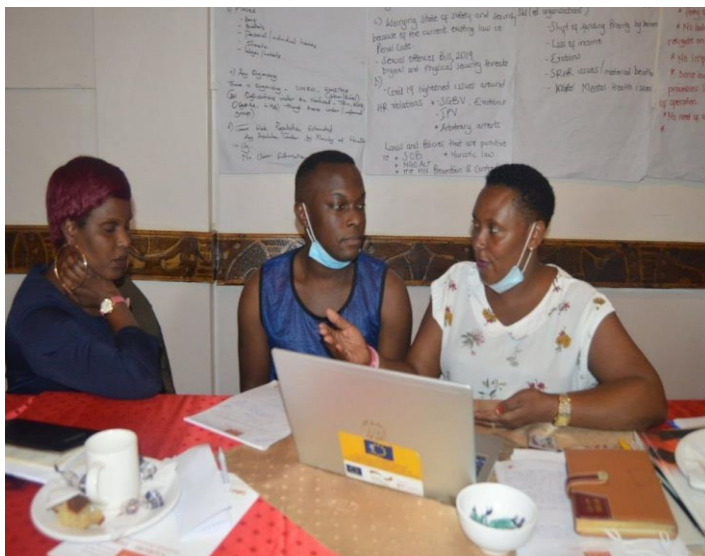
Labor rights training by ASWA