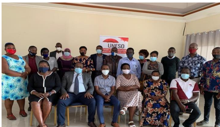
District entry Meeting on PrEP with DHO's from western region

2. Increased policy advocacy to influence change in laws and policies, practices and attitudes that affects sex workers. This has been achieved through continuous stakeholder engagements, awareness creation on issues that affects sex workers that need advocacy, and strengthening partnerships and collaborations aimed at creating supporting and building synergy on issues that promote and protect the rights 'of sex workers in all their diversity. Over the year, UNESO has conducted seven (7) stakeholder dialogue meetings targeting one hundred eighty five (185) stakeholders at both national and district level including health stakeholders, policy makers, influencers and enforcers, religious/cultural leaders, and teams at district local governments to discuss and strategise on how to promote human rights of sex workers, work to reduced HIV prevalence and promote access and uptake of SRHR services among sex workers. UNESO collaborated with Ministry of Health (MOH) to train 60 health workers from Rwenzori region on provision of friendly health care services among sex workers with the aim to influence attitude towards sex workers, improve PrEP and SRH uptake among sex workers.